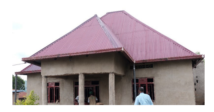
Jean de Dieu is constructing a modern house which will be completed in June 2024.

"Working with cooperatives helped me to elevate my knowledge and agronomical skills in addition to gaining access to the stable market of African Improved Food (AIF). In the future, I plan to expand my plot and diversify the business into livestock and selling inputs as an agrodealer" says Jean de Dieu Harerimana.